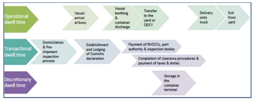
Fig.1. Components of Cargo Dwell time

The pavement of a small area in the import yard is expected to increase yard capacity by a few hundred TEUs, and the transfer of very long-stay containers and confiscated containers to a separate storage area could also release some capacity.